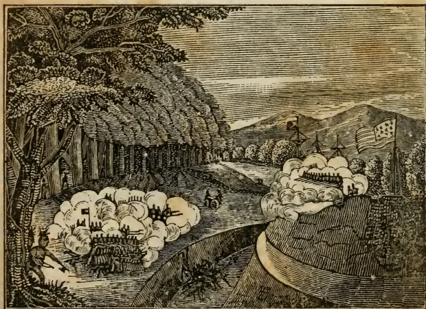
GALLANT DEFENCE OF FORT SANDUSKY, BY MAJOR CROGHAN